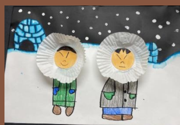
Canaan B. (2 nd )